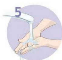
Rinse your hands