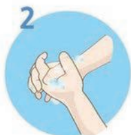
Rub palm to palm with fingers