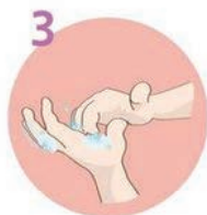
Rub tips of fingers