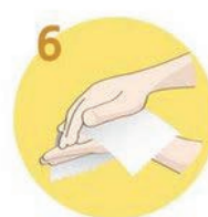
Dry your hands