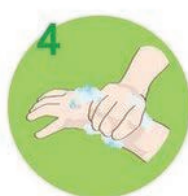
Rub each wrist